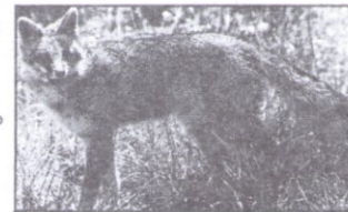
Adult Grey Fox

For more information on these beautiful creatures visit: www.desertusa.com/june96/du_cycot.html and www.nationalgeographic.com search: coyotes