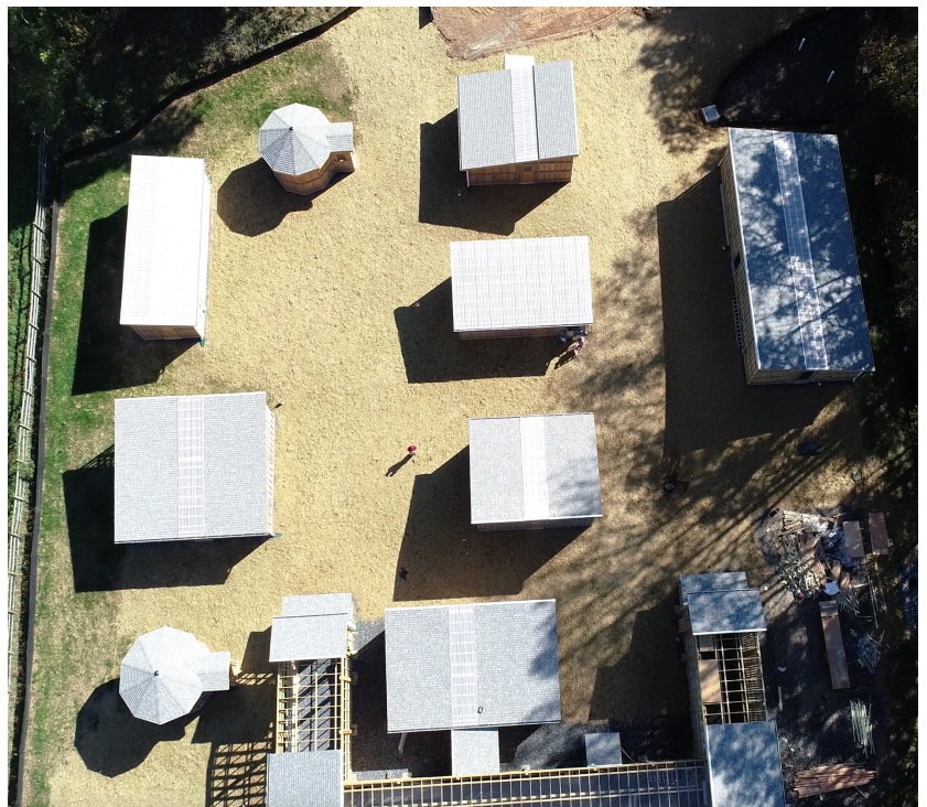
Drone photo from high above the outdoor pre-release enclosures. Many have sections of polycarbonate roofing for natural lighting.