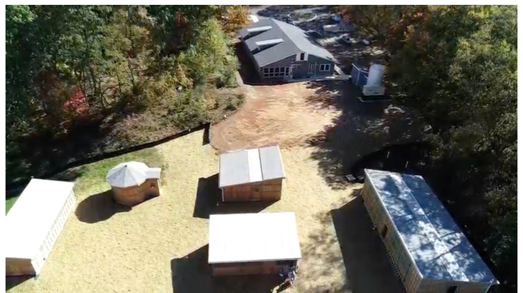
Drone photo showing some of the enclosures in the foreground and the back of the grey clinic building at the top.