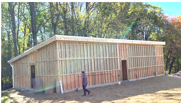
Waterfowl / Shorebird enclosure near completion. Features in-ground fiberglass pools. Note size of person for scale.