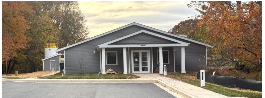
ADA compliant front entrance with automated doors