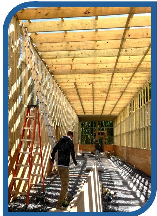
This shows workers building SCWC's 100'x20' flight center – the only one of its kind in Maryland!

CUT ON DOTTED LINE & SAVE FOR FUTURE REFERENCE